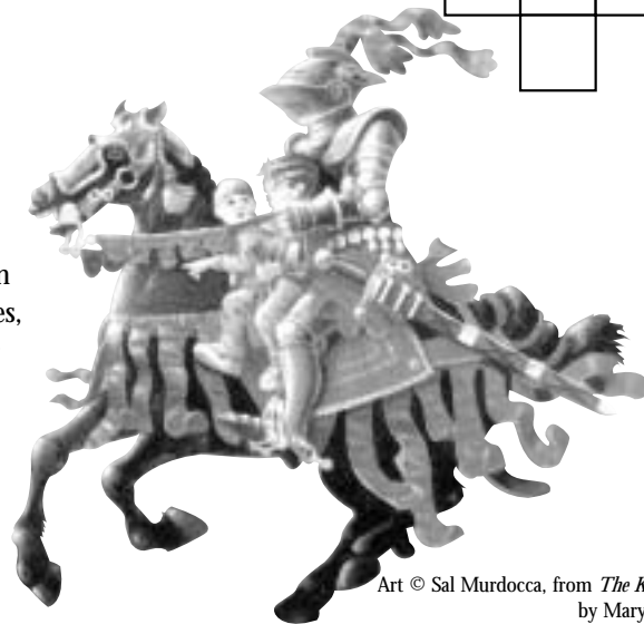
from The Knight at Dawn, by Mary Pope Osborne

To read all of the books in the Magic Tree House series, visit your local library or bookstore.