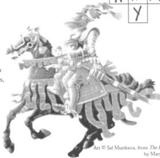
from The Knight at Dawn, by Mary Pope Osborne

To read all of the books in the Magic Tree House series, visit your local library or bookstore.