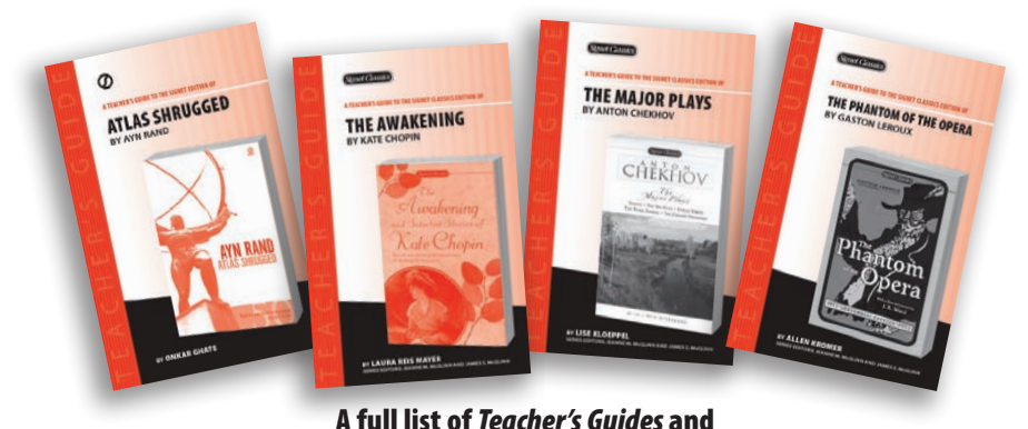
Teacher's Guides for the Signet Classic Shakespeare Series is available on Penguin's website at: us.penguingroup.com/tguides